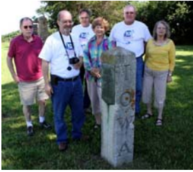
Iowa Annual Conference Committee enjoys a beautiful day on the JH