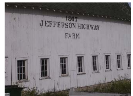
Another stop on the Conference bus tour.

2015: (centennial year) New Orleans, Louisiana