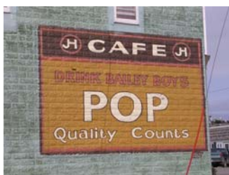
Does anyone know where this freshly painted billboard is located?

The JHA shall be exclusively charitable and educational within the meaning of Section 501(c)(3) of the Internal Revenue Code. (The JHA shall be a not-for-profit organization and as it matures, the JHA shall seek official 501(c)(3) status.